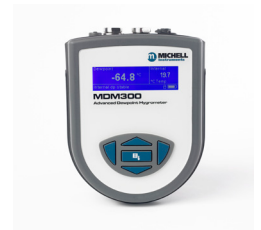
MDM300 Dew-Point Hygrometer