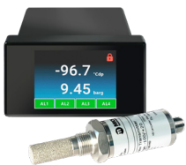
Easidew Advanced Online Dew-Point Hygrometer