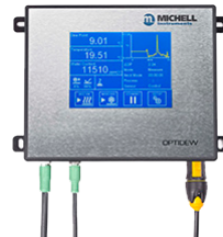
Optidew 501 Chilled Mirror Hygrometer