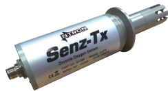
Senz-TX Oxygen Transmitter