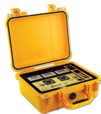
YellowBox Portable Portable Oxygen Analyzer